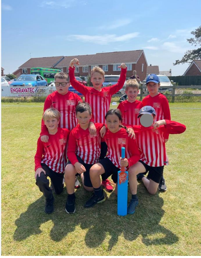
Well done to our 2 teams who took part in the Trowbridge Schools Cricket Tournament at Trowbridge Cricket Club last week. One team made it to the quarter-finals and the other to the semi-finals! Wishing our girls team lots of luck as they compete this week.